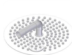
▪ Nozzle plate