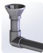
▪ Cone diffuser