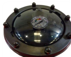
▪ Black top lid with screws