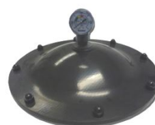
▪ Top Ø400 manhole on 1050 and 1200 models