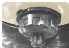
▪ Sand drain 2 ½"