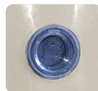
▪ Optional sight-glass